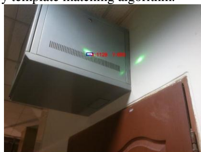
Figure2. Identifying the correct location of laser spot by Template Matching algorithm

Where the result array reaches its maximum, means that the most correlation is occurred there. Whatever the number is closer to one, the correlation is stronger. High correlation is a symptom of most similar shape to template. So by finding the corresponding coordinate to maximum value of the result array, the location of laser spot is found. So after eliminating errors of previous process, Figure 2 shows the right location of laser spot detected by template matching algorithm.