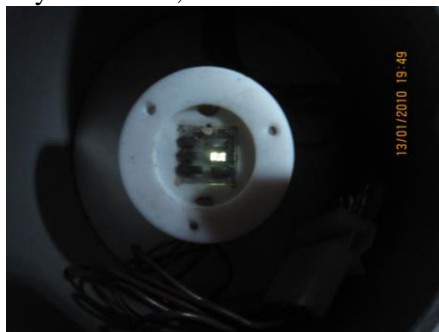
Figure 2. Illumination from the white OLED, based on the combination of prime blue emission and the complementary orange emission.

particular, we showed based on a wide-band-gap host polymer; namely polyfluorene (F8=PFO), and with a careful doping/blending protocol of the host layer with different emissive materials, we can effectively fabricate a full range of colourful OLEDs and since this fabrication procedure is reasonably accessible, it seems solution-based