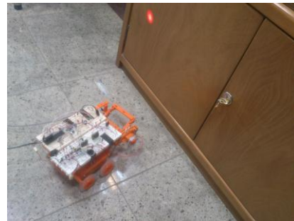
Figure3. The hardware system contains of a four wheel chassis with a rolling arm on the head

The second section of the system deals with the system control. As shown in figure 3, the system hardware consists of a 4 wheel chassis with a rolling arm. The camera will be mounted on the arm on the head of the machine. The controller circuit is also mounted on the device.