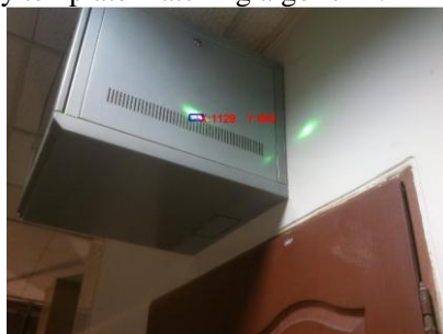
Figure2. Identifying the correct location of laser spot by Template Matching algorithm

Where the result array reaches its maximum, means that the most correlation is occurred there. Whatever the number is closer to one, the correlation is stronger. High correlation is a symptom of most similar shape to template. So by finding the corresponding coordinate to maximum value of the result array, the location of laser spot is found. So after eliminating errors of previous process, Figure 2 shows the right location of laser spot detected by template matching algorithm.