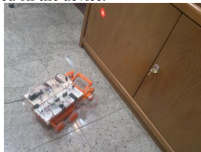
Figure3. The hardware system contains of a four wheel chassis with a rolling arm on the head

The second section of the system deals with the system control. As shown in figure 3, the system hardware consists of a 4 wheel chassis with a rolling arm. The camera will be mounted on the arm on the head of the machine. The controller circuit is also mounted on the device.